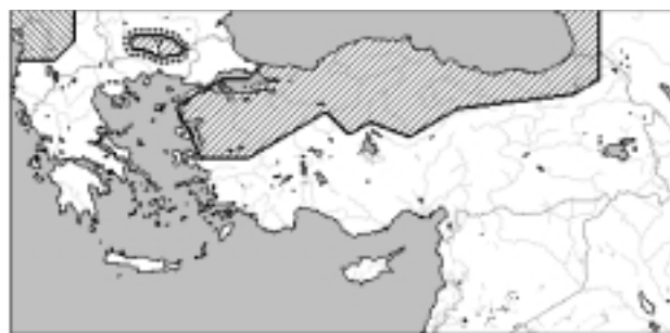
Fig. 5. – Distribution of Euscorpium germanus (C.L. Koch) \\ \\ and Euscorpium mingrelicus (Kessler) /// (Euscorpiidae) according to Kinzelbach (1985). +++ and ? probably a form of E. carpathicus („ E. germanus croaticus “) (Fet & Braunwalder, present study).

KINZELBACH (1975) treated this taxon as a subspecies of E. germanus (C.L. Koch, 1837). BONACINA (1980)