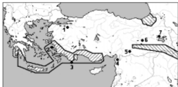
Fig. 2. – Distribution of Iuridae: Iurus dufoureyus according to KINZELBACH (1985) ///; CRUCITTI (1995b) ..... Calchas nordmanni according to KINZELBACH (1985) \\\ and recent new findings: 1 = VACHON & KINZELBACH (1987); 2 = Island of Samos (SISSOM, 1987); 3 = Megisti Island (collection Braunwalder); 4 = Antakya; 5 = Halfeti, 6 = Malatya, 7 = Nemrut Dagı (collection Kovárik, pers. comm.).

The only species currently recognized is Iurus dufoureyus (Brullé, 1832), common in the southern Greece, the Aegean islands and southern Turkey. Its ecology in Peloponnesos was recently studied by CRUCITTI (1995a, b). The type locality is unclear and was referred only to "Morea". Type(s?) probably is lost. Designation of the neotype is planned from Greece. The status of subspecies I. d. asiaticus Birula, 1903 (type in St. Petersburg) from Anatolia is problematic. Francke (1981) considered it a separate species. KRITSCHER (1993) analyzed a larger series of specimens and concluded that this form has only the status of a subspecies. Variation of this species from