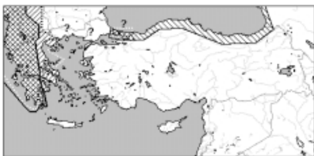
Fig. 4. – Distribution of Euscorpium italicus (Herbst) \\ \\ and “ Euscorpium mesotrichus Hadži, 1929” = ? Euscorpium tergestinus (C.L. Koch) /// according to KINZELBACH (1985)? = estimated but not yet verified occurrence of E. tergestinus (FET & BRAUNWALDER, present study).

This species is found from France to the Caucasus (CAPORIACCO, 1950; KINZELBACH, 1975). No subspecies are currently recognized (VACHON, 1981; BONACINA, 1982). CAPORIACCO (1950) and VACHON (1981) characterized an unusual “oligotrichous” form from Taigetos, Greece. CRUCITTI (1995a) observed ecology, probably of the same form as “ Euscorpium cf. italicus ”. From new DNA-based information available (analysis of the 16S rRNA mitochondrial DNA gene sequences by Gantenbein et al., 1999b) it appears that E. italicus holds a derived place in the phylogenetic tree of the genus Euscorpium and is very closely related to E. carpathicus complex (or maybe even to a certain part of it). Since the major diagnostic character set in E. italicus appears to be a dramatic increase in trichobothrial numbers (VACHON, 1975, 1981), it is very important that “oligotrichous” E. italicus forms from Greece be studied in their relation to “polytrichous” forms of E. carpathicus known from the Balkans (CAPORIACCO, 1950), to further clarify phylogeny of these species. In addition, the range and status of the Black Sea coast populations (all Anatolia to Russia) has to be reanalysed. Designation of the neotype for E. italicus is planned from Italy.