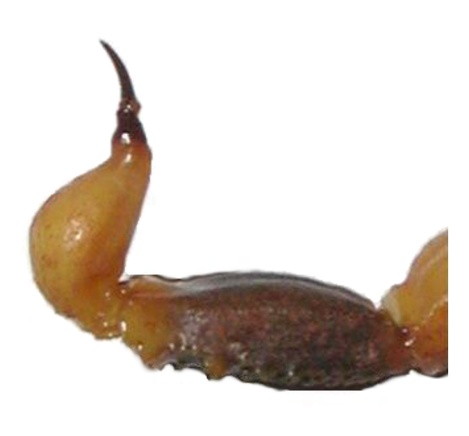
Figure 2: An abnormal structure on telson of L. quinquestriatus (scale: 1 cm).