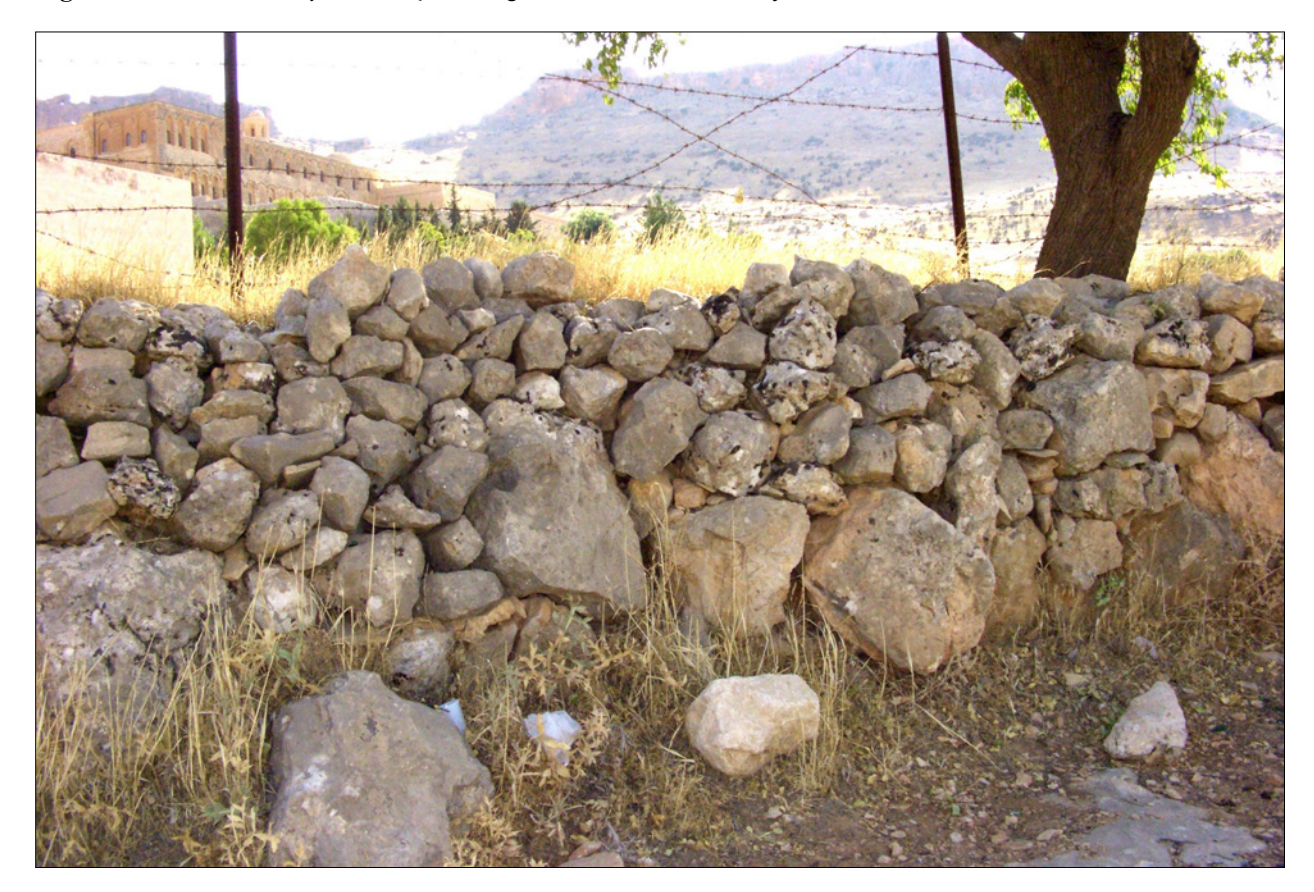
Figure 4: Habitat of Hottentotta saulcyi : Eski Kale, Mardin Province, Turkey.