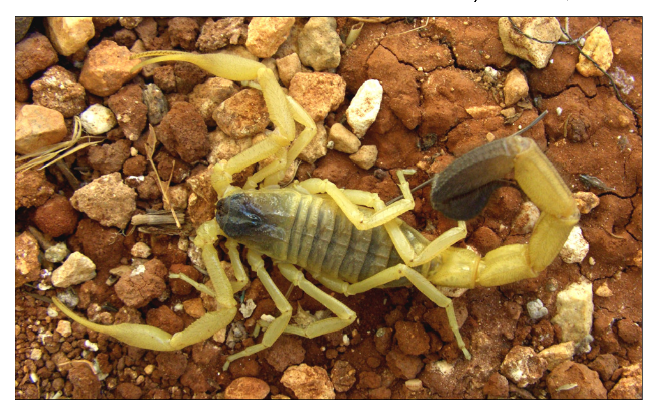
Figure 3: Hottentotta saulcyi from Yeşilli Village, Mardin Province, Turkey.