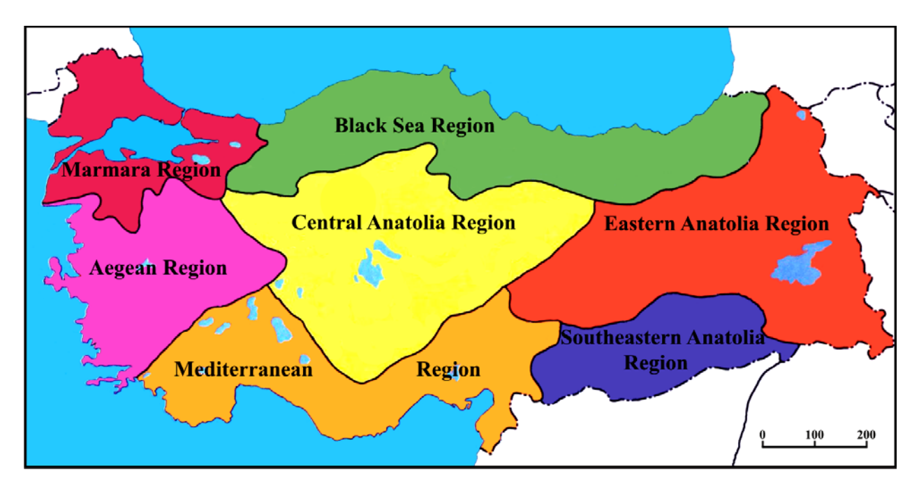
Figure 1: The main ecogeografic and climatic zones of Turkey.

F8T5/BLB). The specimens were fixed in 70 % ethanol and have been deposited in the private collection of Ersen Aydın Yağmur. Scorpions were studied using a XTL-3400E stereomicroscope.