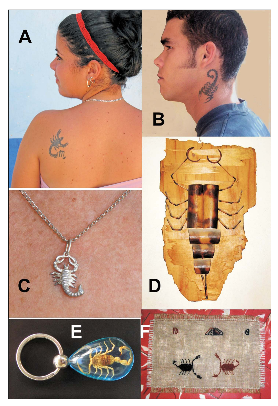
Figure 1: Scorpions as cultural motives in Cuba. A–B , Tattoos on two young people from San Antonio de los Baños, Artemisa Province. C , a silver jewel made in Mexico, borne by a woman in Havana City. D , Bamboo scorpion made by a Cuban artisan. E , a keychain with an acrylic piece containing a scorpion (made in China). F , small carpet made by a young woman artisan from Santiago de Cuba.