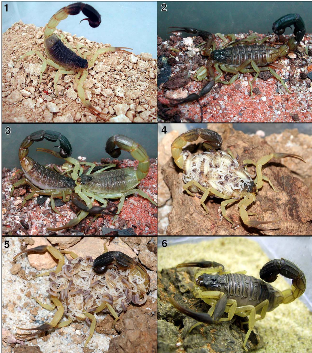
Figures 1–6: 1. F_0 female of Hottentotta salei (pale morph). 2. F_0 male of Hottentotta jayakari (dark morph). 3. Courtship and mating between F_0 male (dark morph) and F_0 female (pale morph). 4. F_1 brood, on instar I. 5. F_1 brood, on instar II. 6. F_1 adult female (dark morph).

Hottentotta jayakari was described by Pocock (1895), as Buthus jayakari , from Muscat in the northern range of Oman. Subsequently, Vachon (1980) described a subspecies of H. jayakari , as Buthotus jayakari salei , from the Province of Dhofar in the South of Oman. The