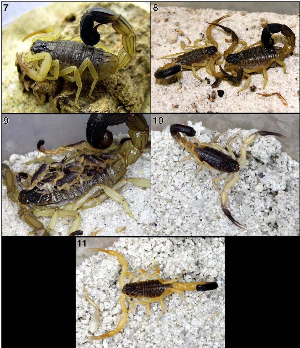
Figures 7–11: 7. F_1 adult male (pale morph). 8. Courtship and mating between F_1 male (pale morph) and F_1 female (dark morph). 9. F_2 brood, on instar II. 10. F_2 juvenile of second instar (dark morph). 11. F_2 juvenile of second instar (pale morph).

follows: “This species was originally described as a subspecies of H. jayakari , however the distribution of the two taxons overlap and the species are easily sep-