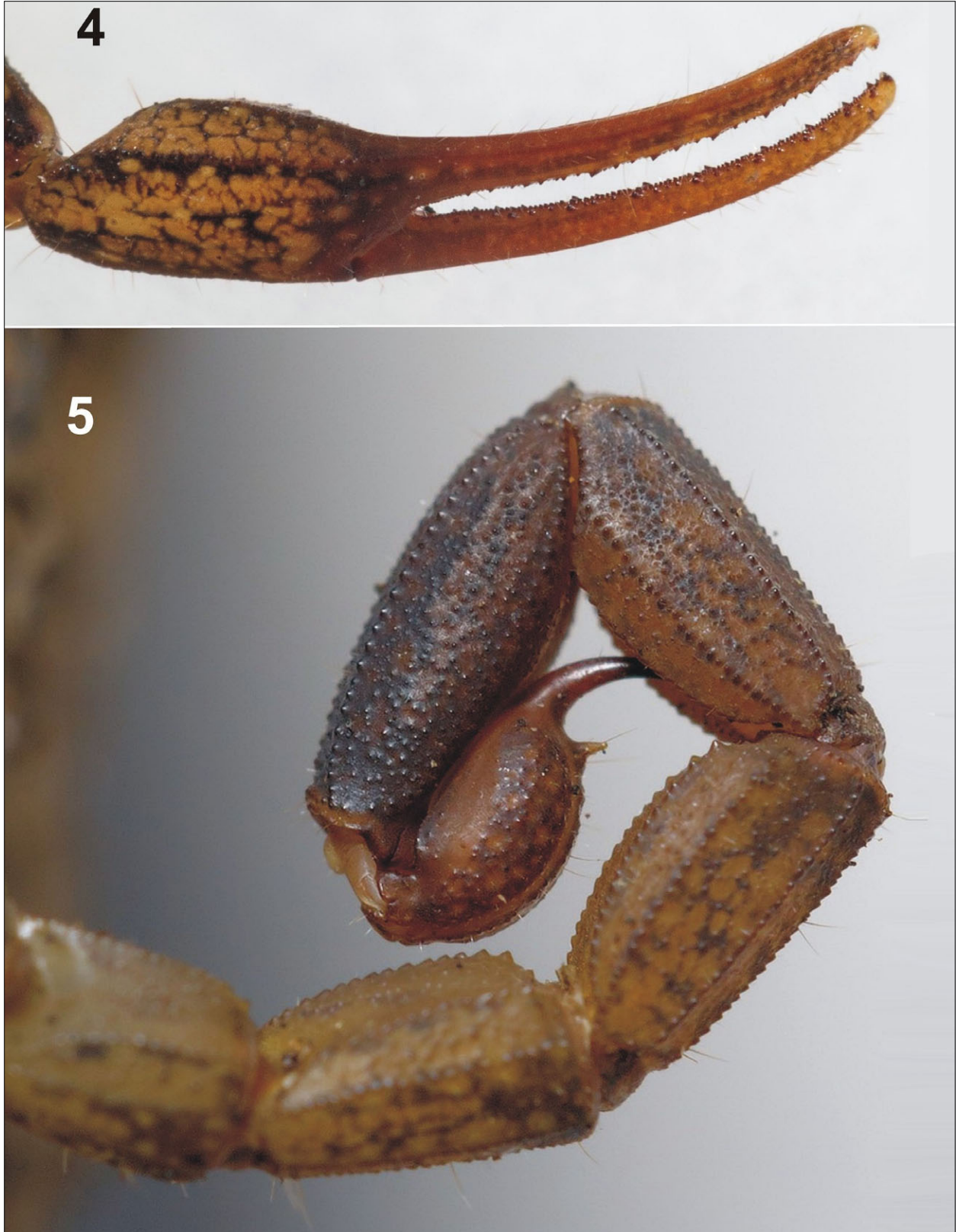
Figures 4–5: Centruroides thorellii . The same female as in Fig. 2: 4, pedipalp chela, dorsolateral aspect; 5, metasoma, lateral aspect.