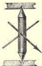
FIG. 2.—DOUBLE-PIVOTED NEEDLE

day-time, and towards the moon and stars at night, as described in the preceding chapter. By means of this instrument you can direct your course towards cities and islands and any other