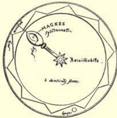
FIG. 4.—PERPETUAL MOTION WHEEL

teeth comes near the north pole and owing to the impetus of the wheel passes it, it then approaches the south pole from which it is rather driven away than attracted, as is evident from the law given in a preceding chapter. Therefore such a tooth would be constantly attracted and con-